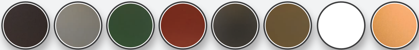
CHARCOAL COLONIAL SLATE FOREST GREEN SIENNA SUNSET HICKORY WEATHERED WOOD WHITE COPPER PENNY