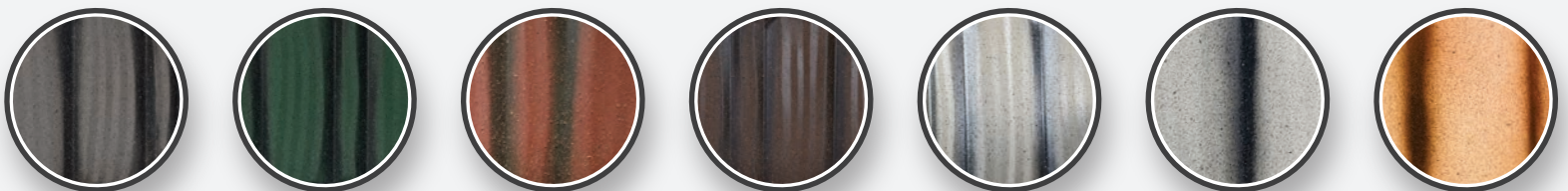
COLONIAL SLATE FOREST GREEN SIENNA SUNSET HICKORY WEATHERED WOOD WHITE COPPER PENNY

*Note: Colors shown in digital file may have slight differences than actual metal product.