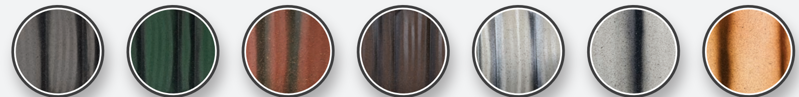
COLONIAL SLATE FOREST GREEN SIENNA SUNSET HICKORY WEATHERED WOOD WHITE COPPER PENNY

*Note: Colors shown in digital file may have slight differences than actual metal product.