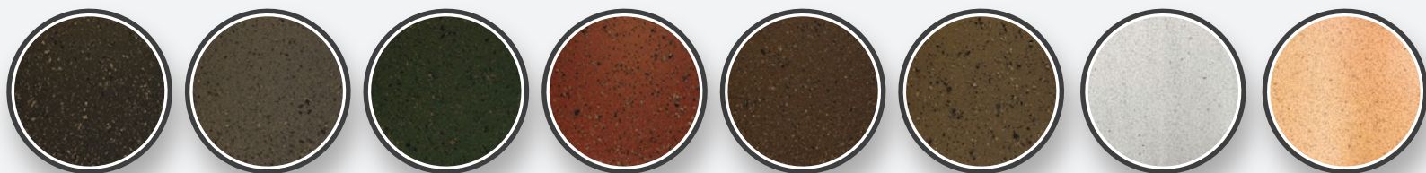
CHARCOAL COLONIAL SLATE FOREST GREEN SIENNA SUNSET HICKORY WEATHERED WOOD WHITE COPPER PENNY